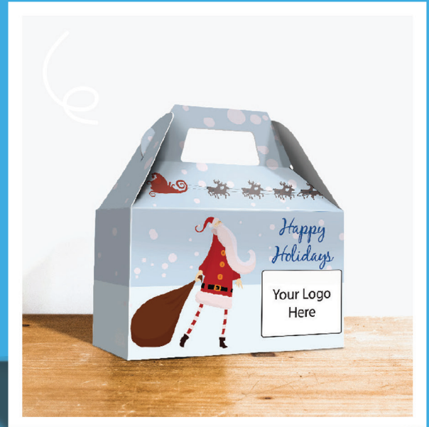
HOLIDAY STOCK DESIGNS HELP YOUR GIFTS BECOME MORE MEMORABLE.

Custom packaging and boxes can turn your brand into the total package with full customization and fast turnarounds.